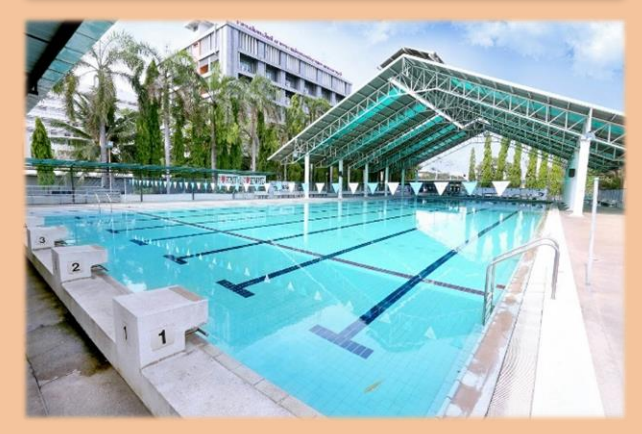
HM building, Faculty of Engineering (KMITL), 1 Chalong Krung Rd., Lat Krabang, Bangkok 10520, THAILAND